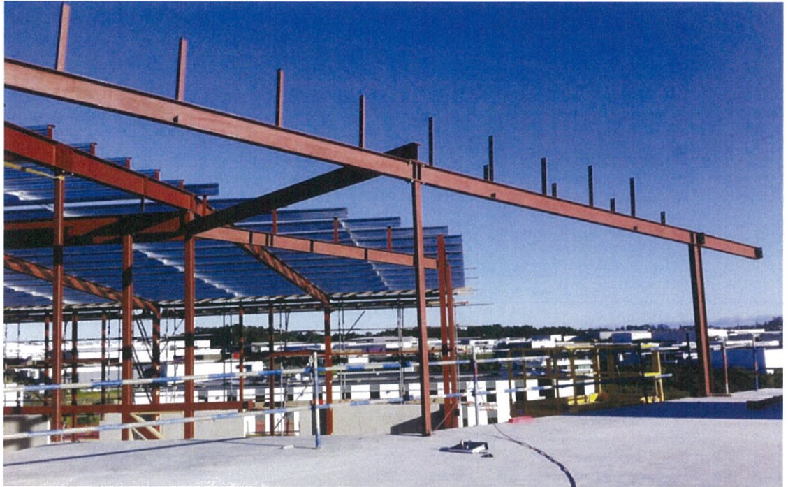
A&S Engineering does a wide range of steel-related work, including large commercial construction projects.